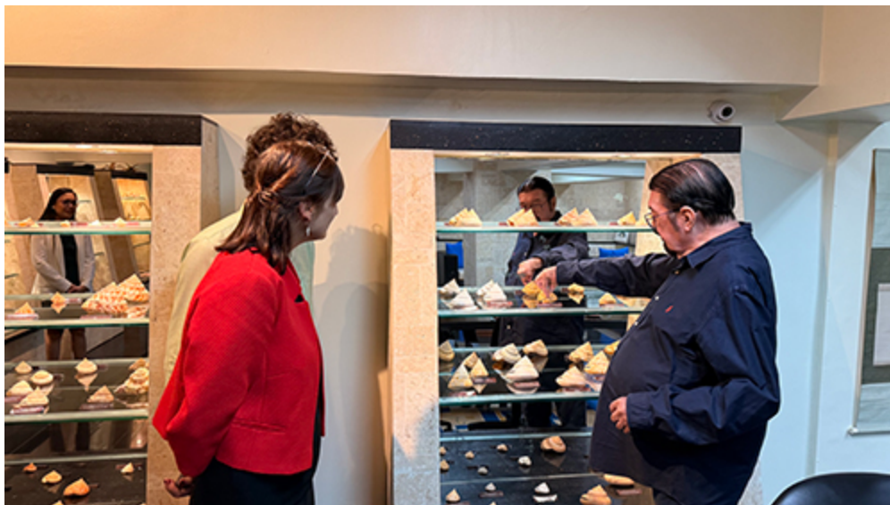
Explaining about slit shells, the PLEUROTOMARIIDAE.